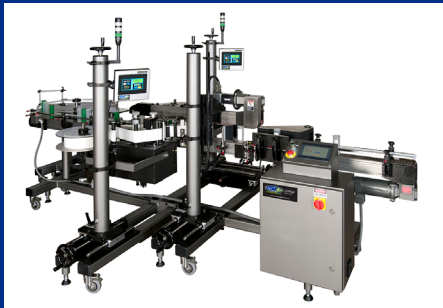
Front/Back/Wrap Labeling System

Not only do we manufacture both standard and print and apply labelers, but CTM Labeling Systems also builds custom-designed and -manufactured labeling systems from the ground up!