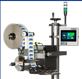
360a Series Label Applicator

As the industry leader in high-performing, quality label applicators, CTM Labeling Systems offers a variety of options when it comes to labeling applicators to fit your business needs!