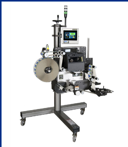
360a Series Integrated Loose Loop Label Applicator