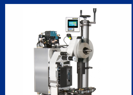
3600a-PA Series Dual Action Tamp (DAT) Printer Applicator