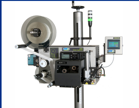
3600a-PA Series Printer Applicator

Our print and apply labeling systems are perfect for those that are in need of a machine that will increase efficiency and improve work processes!