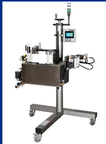
3600a-PA Swing Tamp Print and Apply Labeler