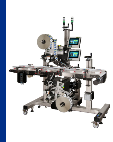
360a Series Top Bottom Split Conveyor Labeling System