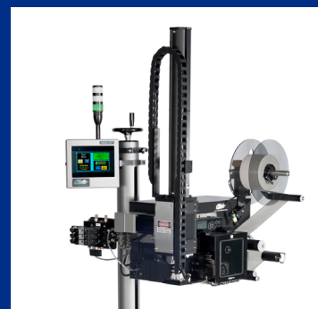
3600 Series Servo Tamp (ST) Printer Applicator