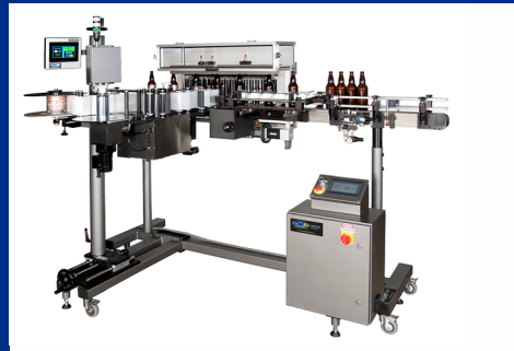
Bottle Labeling Machine - Vertical Trunnion Roller