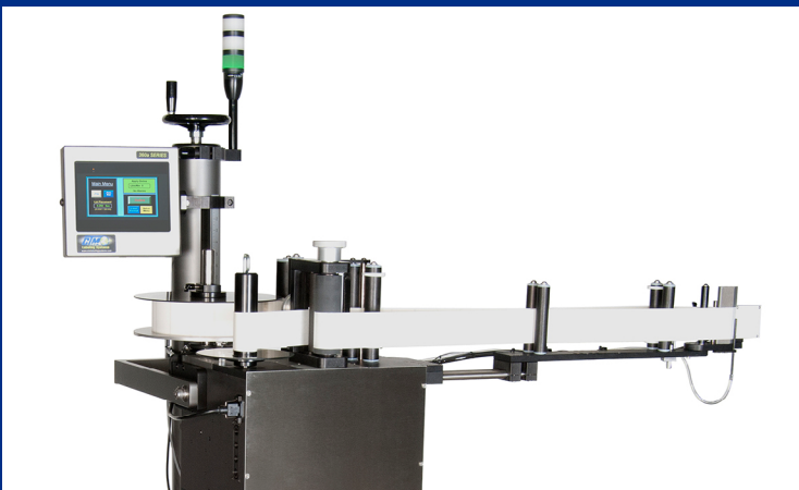
360a Series FFS Form, Fill and Seal Labeler