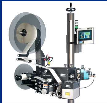
360a Series High Speed Labeler