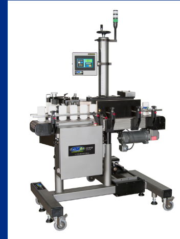
360a Series Wrap System (WR)