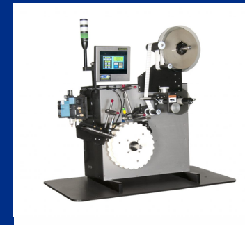
Tabletop Vial Wrap Custom Labeling System