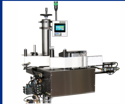
3600a-PA Series Corner Wrap Printer Applicator